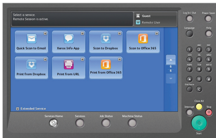
User Interface showing Xerox® ConnectKey Apps.