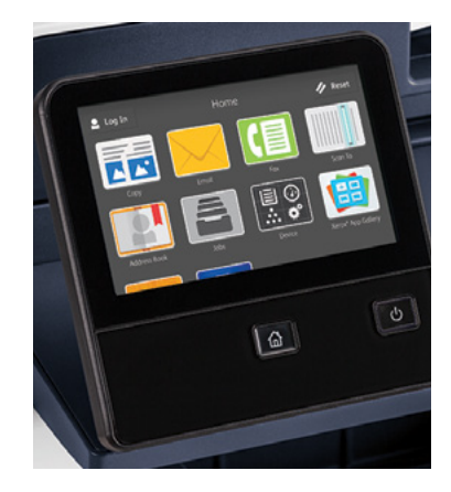
View a demo of our VersaLink device touchscreen at www.xerox.com/VersaLinkUIDemo.

This unmatched balance of hardware technology and software capability helps everyone who interacts with our VersaLink printers and multifunction printers get more work done, faster.