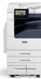
Xerox® VersaLink C7020/C7025/ C7030 Color Multifunction Printer