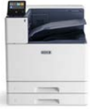
Xerox® VersaLink C8000 Color Printer