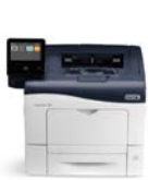
Xerox® VersaLink® C400 Color Printer