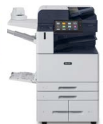
Xerox® AltaLink B8145/B8155/ B8170 Multifunction Printer

To learn more about Xerox® ConnectKey Technology, go to www.connectkey.co.uk .