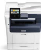
Xerox® VersaLink B405 Multifunction Printer