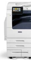
Xerox® VersaLink B7025/B7030/ B7035 Multifunction Printer