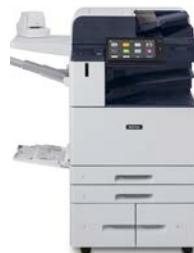
Xerox® AltaLink® C8130/C8135/ C8145/C8155/ C8170 Color Multifunction Printer