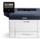
Xerox® VersaLink B400 Printer