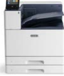
Xerox® VersaLink C9000 Color Printer