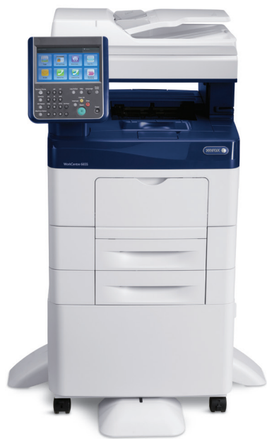
WorkCentre 6655/X shown with one additional tray and stand.