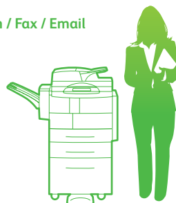
WorkCentre 4260XF with finisher and 2,000-sheet high-capacity feeder

WxDxH: (4260XF) 39.5 x 26 x 46 in. 1003 x 660 x 1168 mm