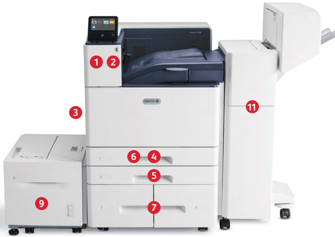
Xerox® VersaLink® C8000 Color Printer Print. Mobile connectivity.