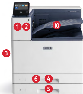
Xerox® VersaLink® C8000 and C9000 Default Configuration

This unmatched balance of hardware technology and software capability helps everyone who interacts with the VersaLink® C8000 and C9000 Color Printers get more work done, faster.