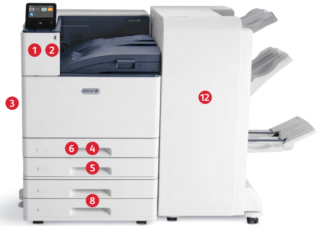
Xerox® VersaLink® C9000 Color Printer Print. Mobile connectivity.

1 Card Reader Bay and internal card reader compartment.