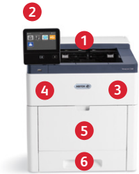
Xerox® VersaLink® C500 Color Printer Print.