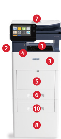
Xerox® VersaLink® C505 Color Multifunction Printer Print. Copy. Scan. Fax. Email.