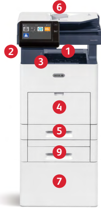
Xerox® VersaLink® B615 Multifunction Printer Print. Copy. Scan. Fax. Email.