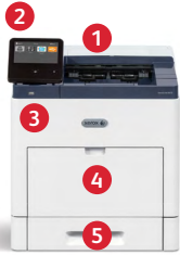
Xerox® VersaLink® B610 Printer Print.