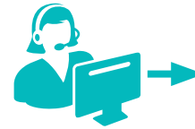
User Group 1 Logs In