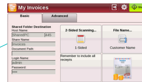
Personalized workflow creation

Show all features to everyone or hide based on user permissions or access rights.