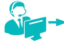
User Group 2 Logs In