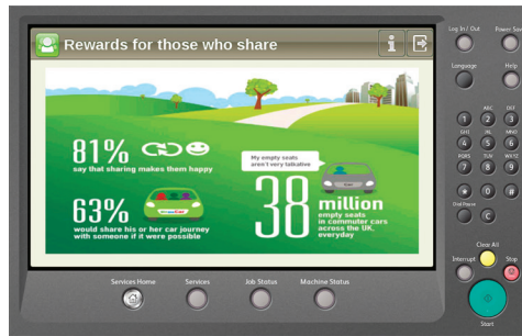
Default Walk-Up Screen (General Info Sharing)

When combined with an authentication method, features can be shown or hidden, including Apps, to those who are meant to use them. This offers a more personalized experience by user or by workgroup which helps to increase productivity and reduce operator errors.