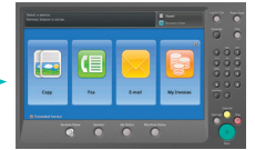
Features Enabled for Group 1