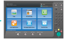
Features Enabled for Group 2

Now apps can help improve any business. Why restrict personalization to individual PCs or mobile devices? Instead, extend the benefit apps bring to the MFP maximizing the investment made to employees or guest users.