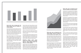
MS Outlook 1 Black and White Page with 2Up printing