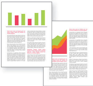
MS Outlook 2 Colour Pages