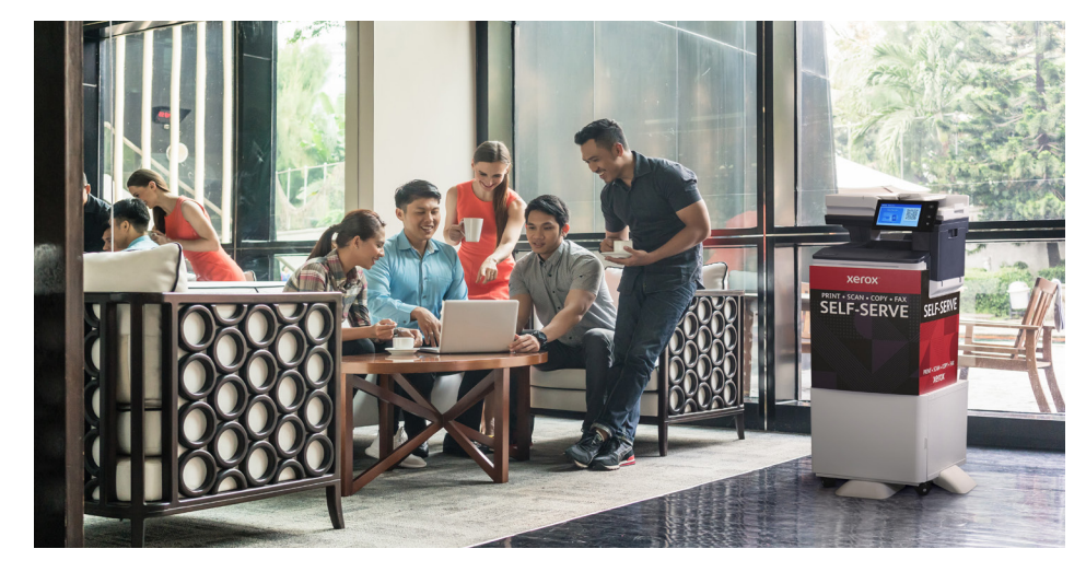
Xerox® VersaLink® C415 Color Multifunction Printer

A game changer in the print industry, the Workplace Kiosk can be placed in almost any environment. Customers simply scan a QR code on the printer to transform their mobile device into a remote multifunction printer. An intuitive, touchless, hassle-free experience.