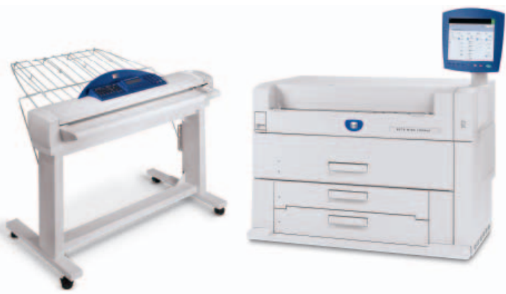
Multi-Function with Wide Format Scan System