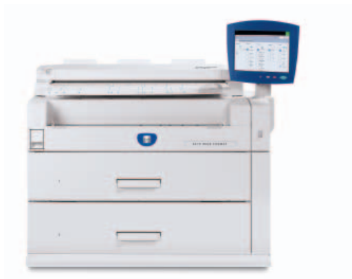
Copier/Printer with On-Board Scanner