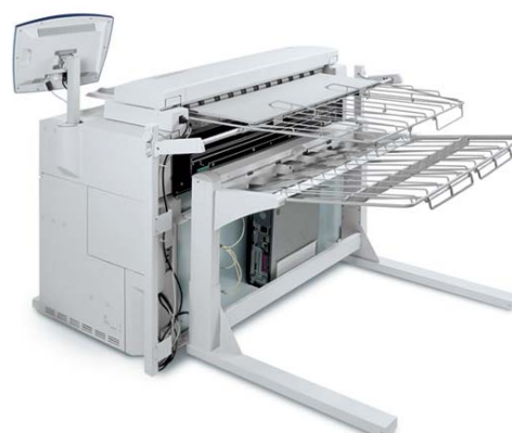
Optional Wide Format Stacker