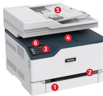
Xerox® C235 Colour Multifunction Printer