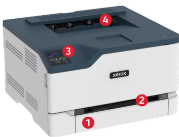
Xerox® C230 Colour Printer