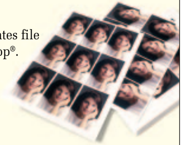
Photo-realistic color comps and pre-film color proofs. Use our standard color profiles or customize your own for the perfect match.

Our PhaserPrint™ plug-in accelerates file download directly from PhotoShop®. Full color RGB files will print in less than 30 seconds. And our image replication feature is ideal for digital photography.