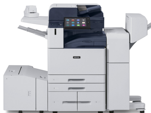
Xerox® AltaLink® B8145/B8155/B8170 Black-and-White Multifunction Printer