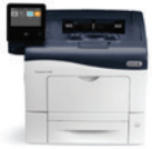
Xerox® VersaLink® C400 Color Printer