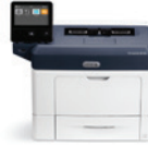
Xerox® VersaLink® B400 Printer