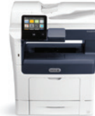
Xerox® VersaLink® B405 Multifunction Printer