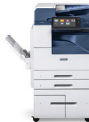
Xerox® AltaLink® B8045/8055/8065/ 8075/8090 Multifunction Printer

To learn more about Xerox® ConnectKey® Technology, go to www.xerox.com .