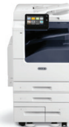
Xerox® VersaLink® B7025/B7030/B7035 Multifunction Printer