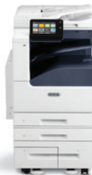
Xerox® VersaLink® C7020/C7025/C7030 Color Multifunction Printer