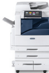
Xerox® AltaLink® C8030/C8035/C8045/ C8055/C8070 Color Multifunction Printer