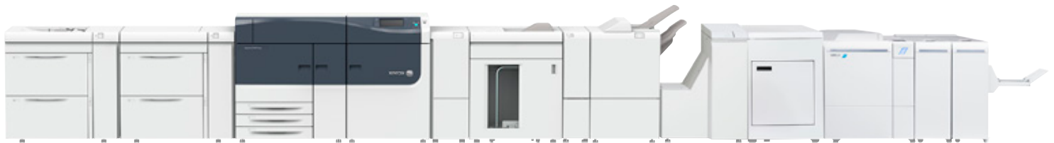
Xerox® Versant® 3100 Press shown with Plockmatic Pro50/35 Booklet Maker

For more information on the Plockmatic Pro50/35 Booklet Maker with Plockmatic RCT, contact your Xerox representative, call 1-800-ASK-XEROX or visit us at www.xerox.com .