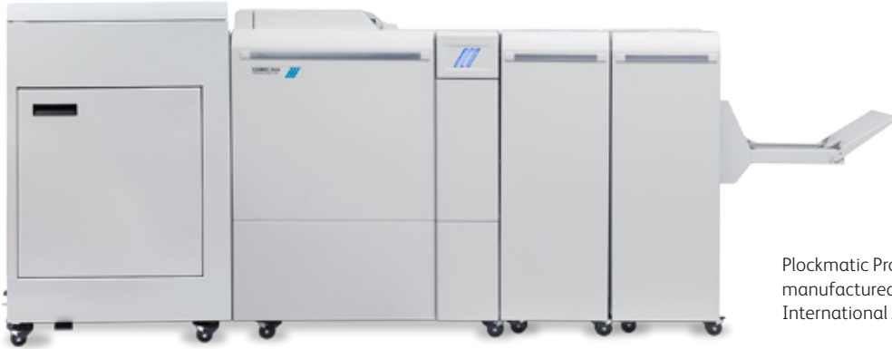
Plockmatic Pro50/35 Booklet Maker, manufactured by Plockmatic International AB

Create professional-quality booklets at rated speed with a compact, affordable inline solution.