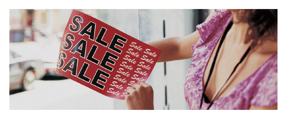
Xerox® NeverTear Window Signs

Our special polyester EA Low Melt Toner fuses the output to polyester using a proprietary chemical bonding methodology, ensuring superior image quality on specialty substrates including polyester and more. Our EA Toner including Premium NeverTear is water, oil, grease and tear resistant.