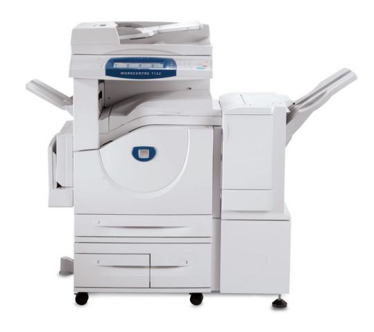
Robust Office Finisher staples sets up to 50 sheets in 3 selectable positions.