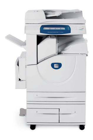
Compact Integrated Office Finisher staples sets up to 50 sheets in a single corner position.