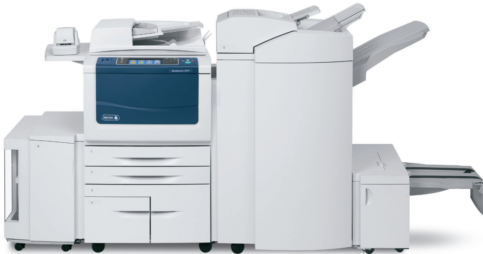
WorkCentre 5875 shown with optional High Volume Finisher with Booklet Maker, Z Fold /C Fold Unit, Post Process Inserter, Convenience Stapler with Work Surface and High Capacity Feeder.