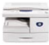
copy : print

For more information, please contact your local Xerox sales representative or visit us at www.xerox.com/office