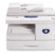
copy : print : scan : fax