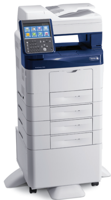
WorkCentre 3655/X shown with 3 additional trays and stand.

The following sections examine each of the Xerox® WorkCentre® 3655 Black-and-white Multifunction Printer’s advantages in greater detail, covering the specific features and performance attributes you should look for in a workgroup multifunction printer. When the same criteria are used to evaluate every device under consideration, you’ll see how the WorkCentre 3655 excels against other manufacturers’ products.