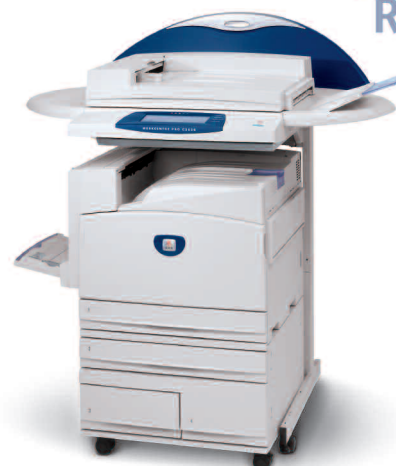
WorkCentre Pro 2636