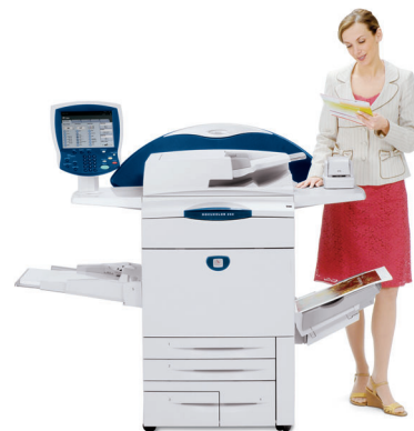
Document Centre 250