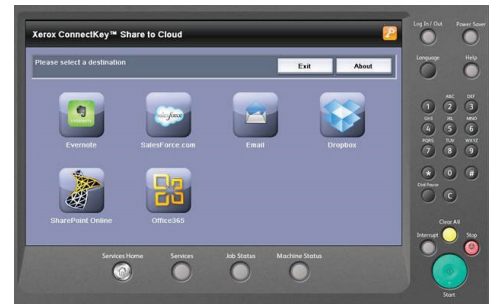
Supports popular cloud repositories.

With ConnectKey Share to Cloud, your organization can take advantage of all that the cloud has to offer: mobile access to your most important documents, improved productivity, increased collaboration, and reduced burden on employees and administrators.