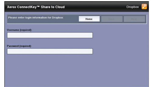
Securely log in on the MFP directly to your preferred cloud repository.