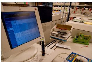
Jobs are routed to the best printer for each job, based on job characteristics and printer capabilities.

Main 585.262.2690 Fax 585.262.4808 E-mail RSAinfo@rocsoft.com Web www.rocsoft.com