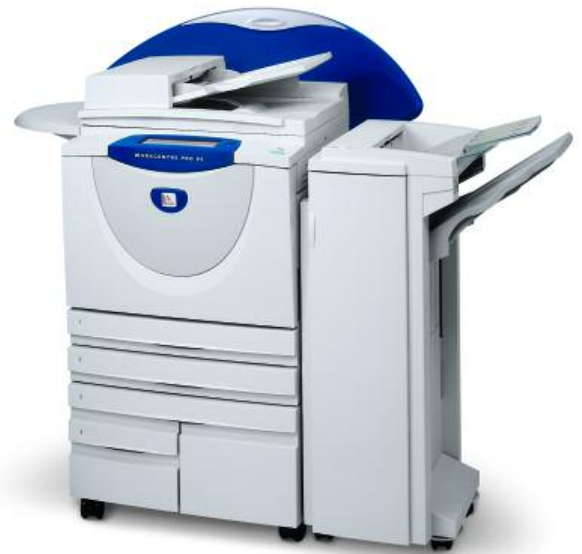
WorkCentre Pro 55 with Office Finisher option

Convenient access is provided to advanced optional functions such as network scanning, fax and e-mail.