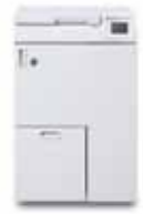
GBC® eBinder 200™