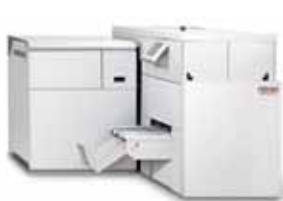
C.P. Bourg PowerSquare™ 200