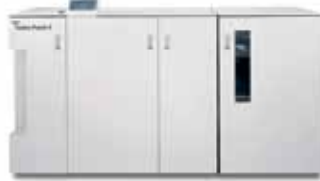
GBC® Fusion Punch® II with Offset Stacker