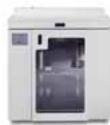
Xerox DS5000 High Capacity Stacker