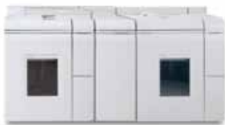
Dual Basic Finisher Modules