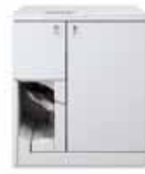
Xerox Tape Binder