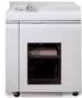
Xerox DS3500 Stacker