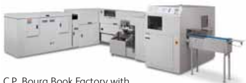
C.P. Bourg Book Factory with CMT 330 3 Knife Trim