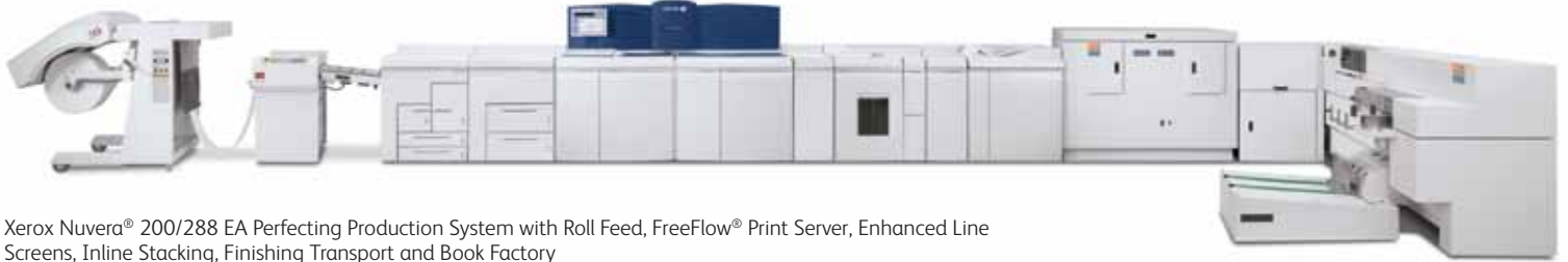
Xerox Nuvera® 200/288 EA Perfecting Production System with Roll Feed, FreeFlow® Print Server, Enhanced Line Screens, Inline Stacking, Finishing Transport and Book Factory