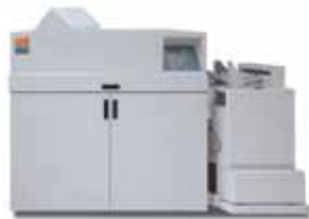
C.P. Bourg BDFx Booklet Maker with Square Edge