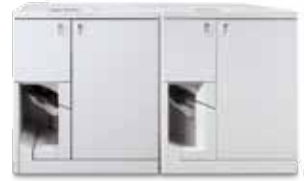
Dual Xerox Tape Binders