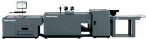
Duplo DBM-5001 Inline Booklet Maker