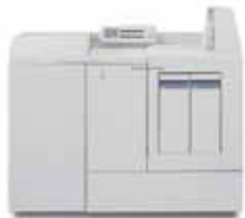
Xerox DB120-D Document Binder