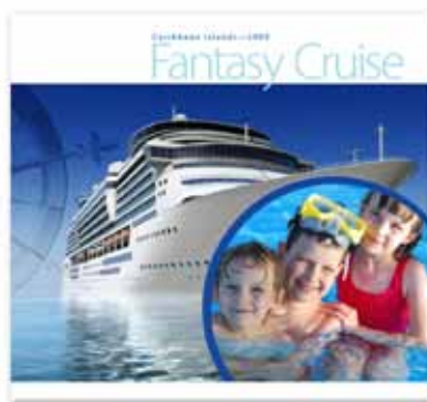
Direct marketing materials