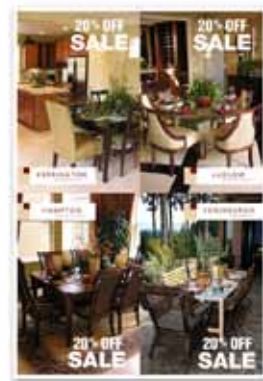
Direct mail postcards