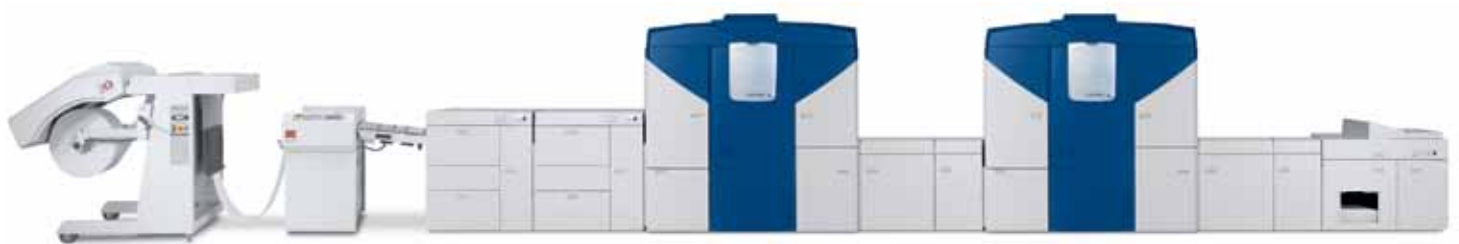
iGen4 220 with roll feed*

With the iGen4 220, the transformation in your business is remarkable. It not only doubles your print productivity, those productivity gains carry through to areas throughout your business.