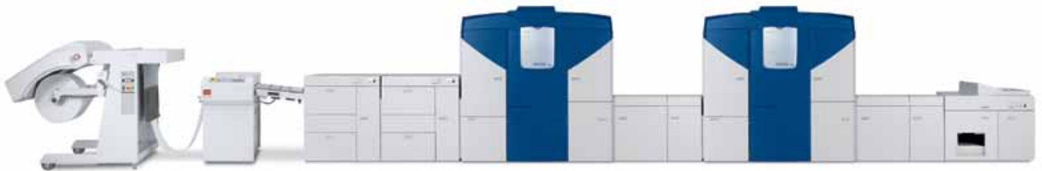
iGen4 220 with roll feed*

With the iGen4 220, the transformation in your business is remarkable. It not only doubles your print productivity, those productivity gains carry through to areas throughout your business.