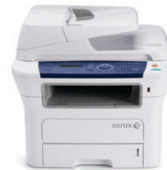
WorkCentre® 3210/3220 Laser Multifunction Printer

Contact your authorized reseller or visit www.xerox.com/government