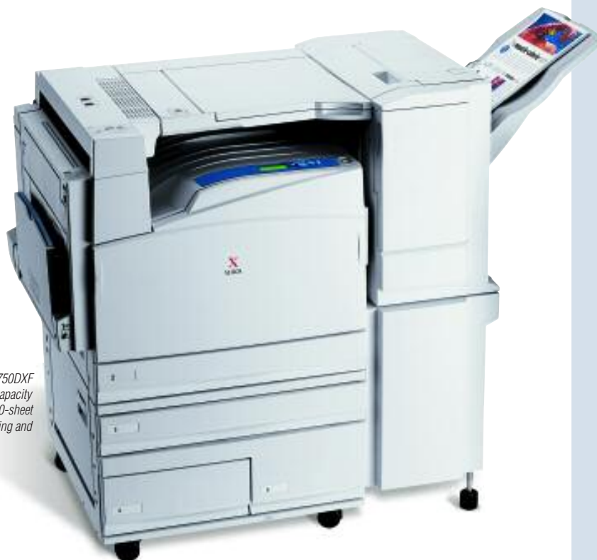
Xerox Phaser EX7750DXF includes a High-Capacity Feeder and a 1,000-sheet Finisher with stapling and offset stacking.