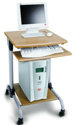
EFI Fiery EX7750 Network Colour Server shown with optional FACI kit and Server Stand.