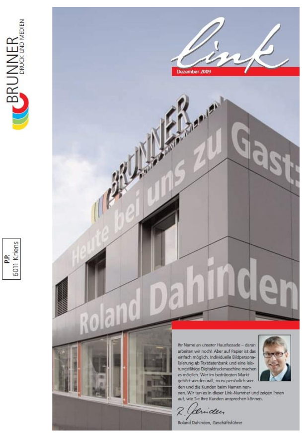
Figure 6: Brunner's Link Magazine, Printed on its Xerox iGen4® Featured Personalization

"Image personalization is great door opener for marketers and advertising agencies." Dahinden says. "Media theorist Marshall McLuhan once said the 'The medium is the message' and that is certainly true with personalized digital printing," he contends.