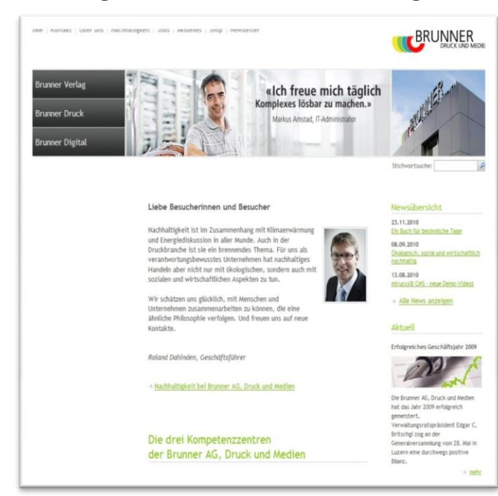
Figure 2: Brunner Druck Home Page