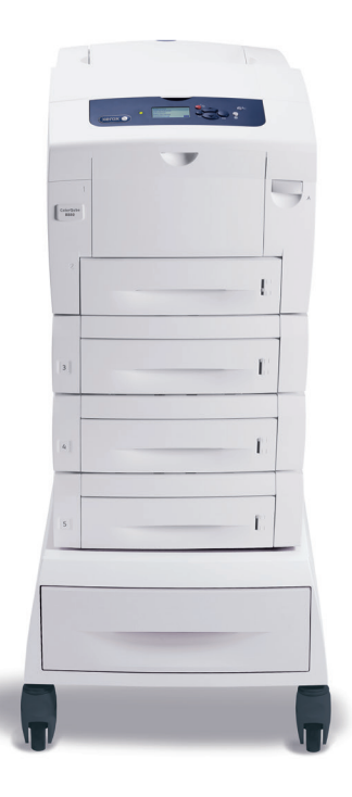
Xerox<sup>®</sup> ColorQube<sup>®</sup> 8880DN shown with 2 additional 525-sheet paper trays and System Cart with Storage Drawer.