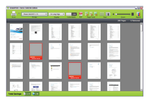
The GreenPrint tool's intuitive user interface.