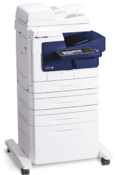
Image shown includes additional options