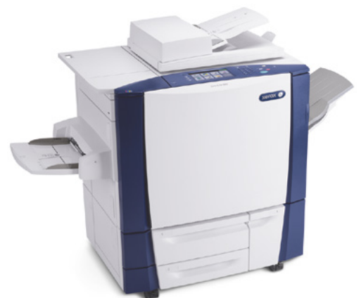
Image shown includes additional options

Find out how much you could save by analysing your colour documents at http://www.xerox.com/docanalyzer .