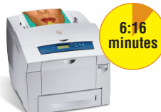
Phaser 8550: one suite in 6:16 minutes