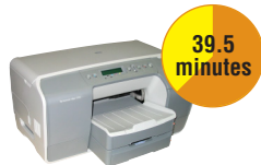
HPBIJ 2300: one suite in 39.5 minutes