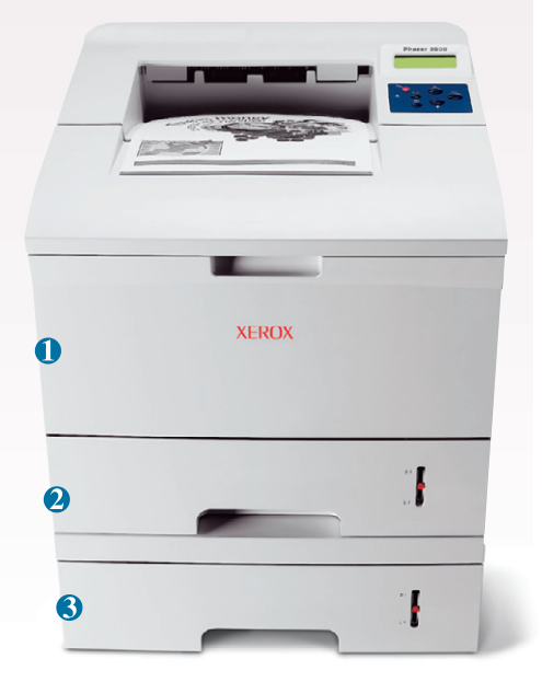
Phaser 3500 printer shown with optional 500-sheet feeder