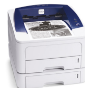
Phaser 3250 shown with optional Tray 2