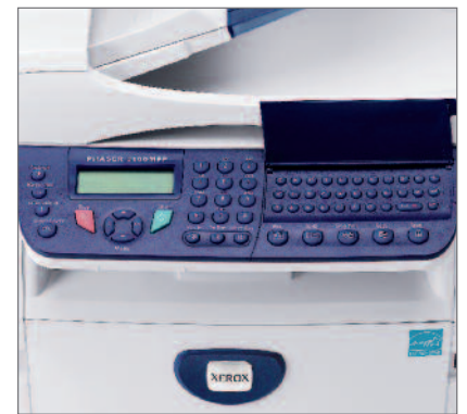
The Phaser 3100MFP/X fax configuration includes a full keyboard for easy text entry.

The Phaser 3100MFP print driver - with a clear, graphical user interface - provides an easy, intuitive way to interact with the system.