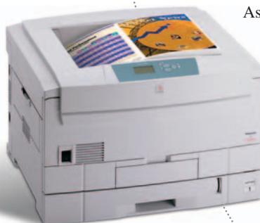
Phaser 7300 network color laser printer